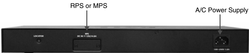
Figure 1-2. Back-Panel Power Connector

The power connectors are positioned on the back panel. Connecting a Redundant Power Supply (RPS) or Modular Power Supply (MPS) is optional, but recommended. The RPS or MPS connector is on the back panel of the switch. The RPS is used for non-PoE switches and MPS is used for PoE switches.