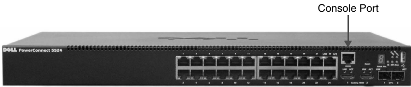
Figure 3-1. Front-Panel Console Port